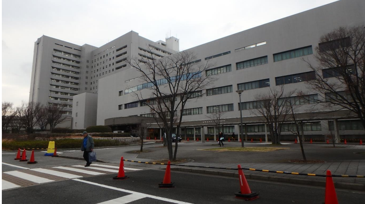
(Osaka University Hospital)

It is a great honor to be selected for the APAO IFP. This was a great opportunity for me to broaden my horizon in Department of Ophthalmology, Osaka University Graduate School of Medicine, Osaka, Japan.