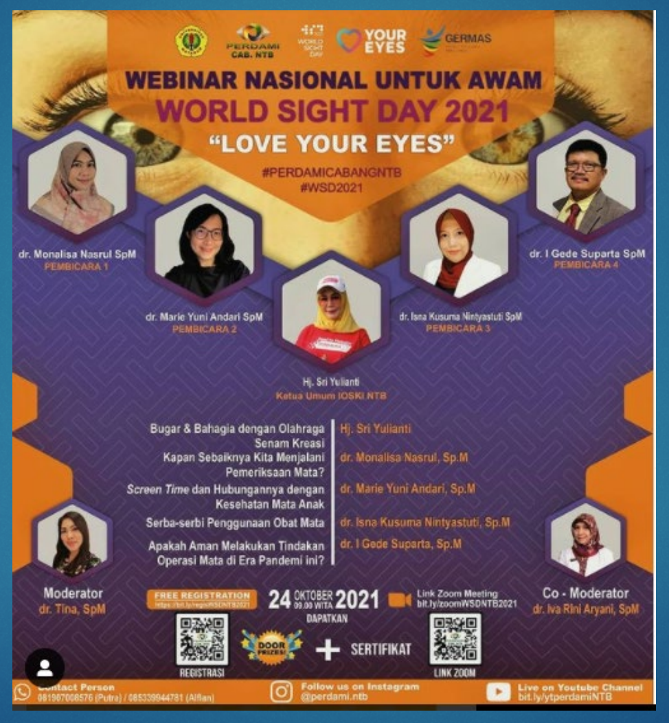
"Love your eyes" national public Webinar