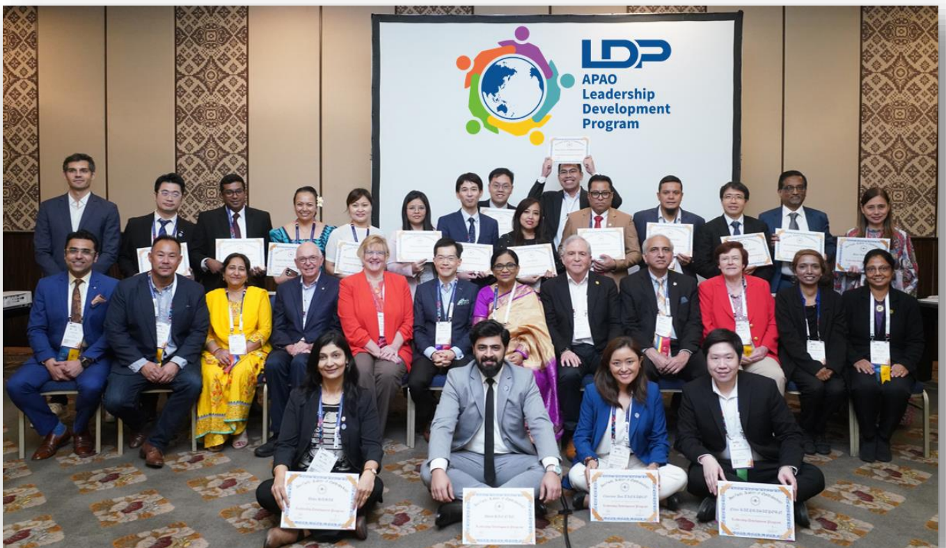
Class 2023-24 Graduation Ceremony