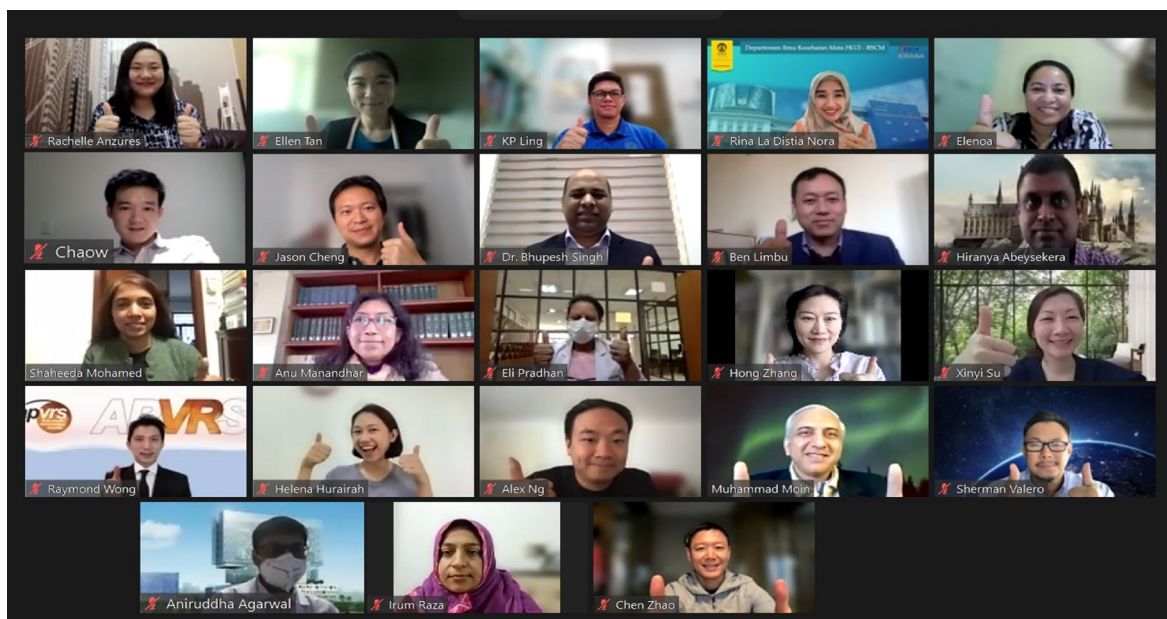
Class Participants and Faculty at the 2022 Online Master Class